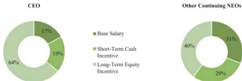
2014 NEO Target Compensation Mix

under the 2014 annual and long-term incentive plans was payable in equity awards, and for our other continuing NEOs, on average 40% of the total target compensation mix was payable in equity awards. The following graph reflects the mix of target compensation of our CEO and our other continuing NEOs in 2014: